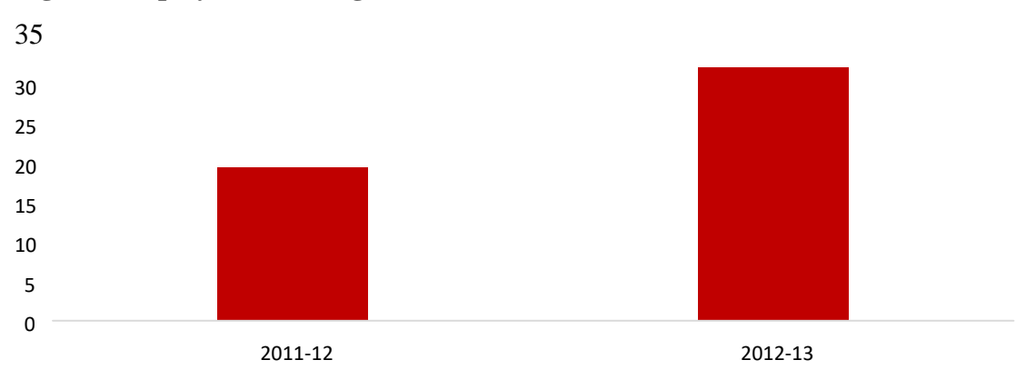
Fig 3 Unemployment among Graduate in India from 2011-12 to 2012-13